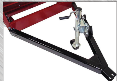
Dolly Wheel Jacks Standard on C-25GD and C-50GD