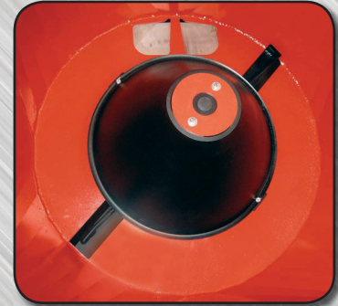
Coned material diverter and full length agitator blades