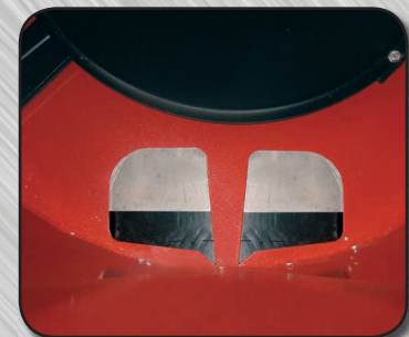
Two large shutter openings for the release of bulky material