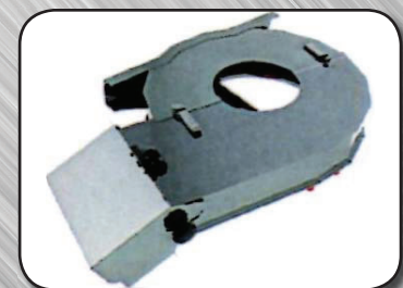
Stainless steel side conveyor to spread down the row line