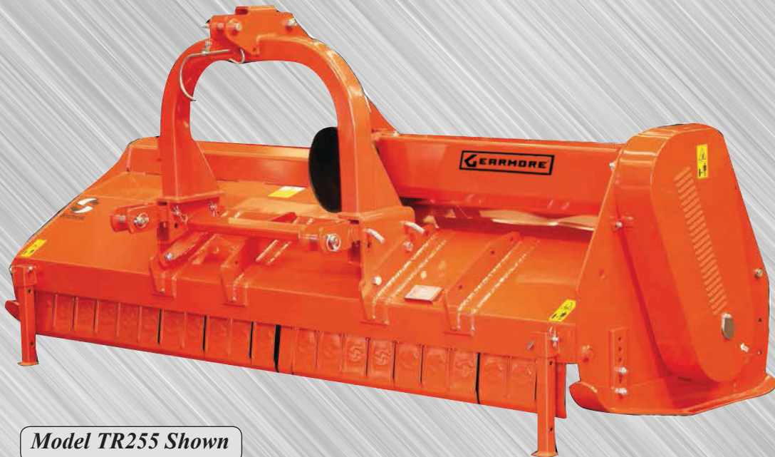
Model TR255 Shown

Our TR Series shredders feature a 90 horsepower gearbox, center mount with offsetable position, special lockable open tailboard with optional deflector brackets for spreading out shredded material, and adjustable foldaway gauge wheels.