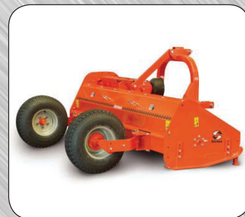
Gauge Wheels in Operating Position