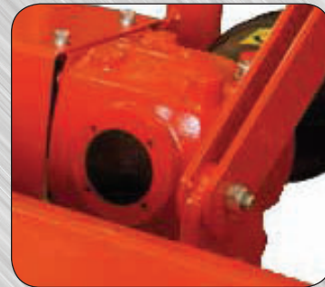
Heavy Duty 90 H.P. Gearbox